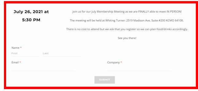
Link to External Sign Up (Link to another website or PDF Sign UP)