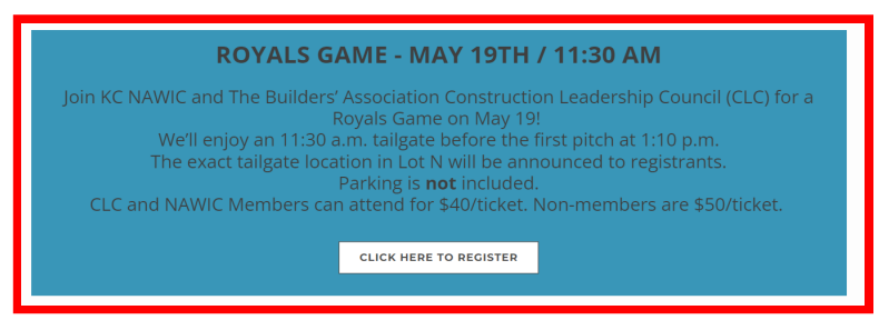
Sign Up with Link to Square Purchases